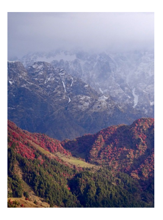
Photo at left is Khalia Top in Munsiari, Uttarakhand, India, at an elevation of approximately 12,000 ft, showing mid-elevation areas supporting wildlife like rhododendrons, seen here flowering in the foreground.

He urges conservationists and other scientists to continue to question fundamental assumptions about nature, because, the reality is often surprising. "In the natural world, even things we think we know really well, we don't actually know," says Tingley.